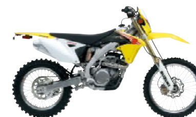
Solid Black / Champion Yellow No.2 (GY8)

Specifications, appearance, colors (including body color), equipment, materials and other aspects of the "SUZUKI" products shown in this catalogue are subject to change by Suzuki at any time without notice, and they may vary depending on local conditions or requirements. Some models are not available in some regions. Each model may be discontinued without notice. Please inquire at your local dealer for details of any such changes.