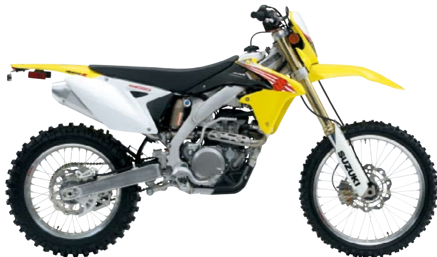
Solid Black / Champion Yellow No.2 (GY8)