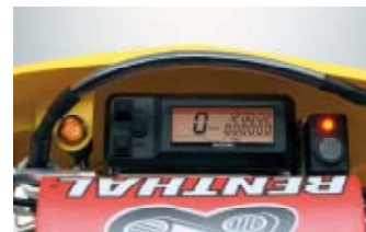
Useful instrument cluster