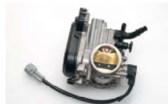
Fuel injection system